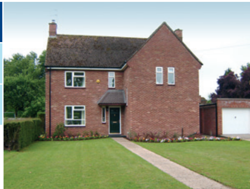
Picture shows typical 3 bedroom detached home available at Slessor Park.

The Cathedral City of Norwich is approximately 25 miles away and offers high street stores, modern shopping malls and an array of pubs, restaurants, sports and leisure facilities.